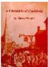
'A Chronicle of Cuckfield' by Maisie Wright Price: £4

Describes the lives of the London children who were evacuated to Cuckfield during the Second World War, as recounted by themselves as adults.