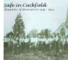
'Safe in Cuckfield' Price: £2

A book published by a local author which showcases old photographs and tales of Cuckfield.